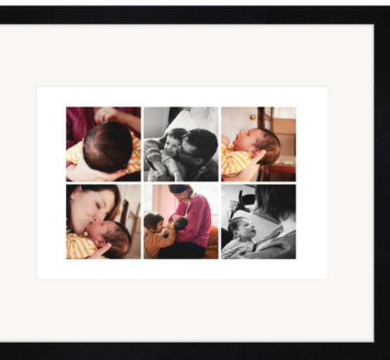
20 x 24" frame with collage of 6 images - £259

Stunning collages set within timeless box style frames, showcasing all your memories together.